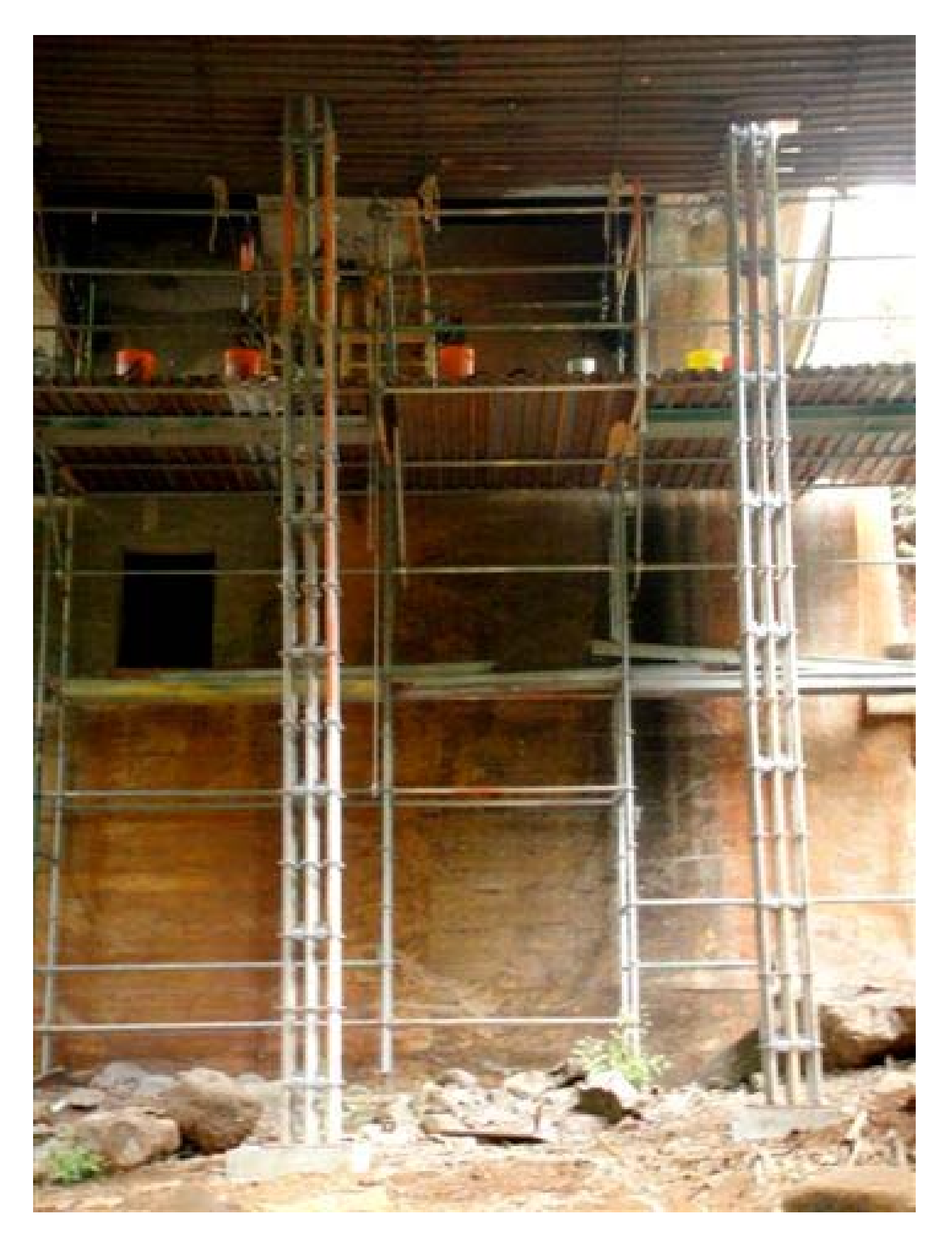
Shoring Support Scaffold Tower