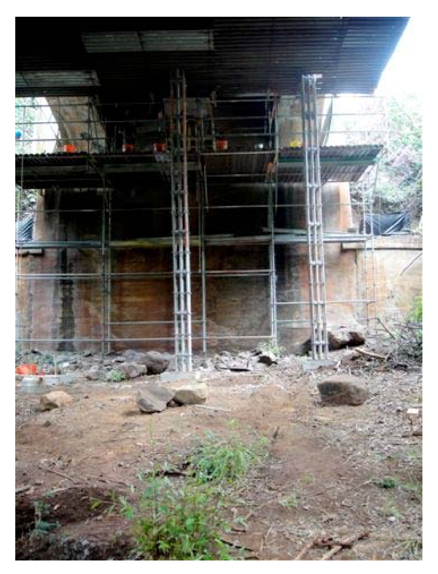
Shoring Support Scaffold Tower