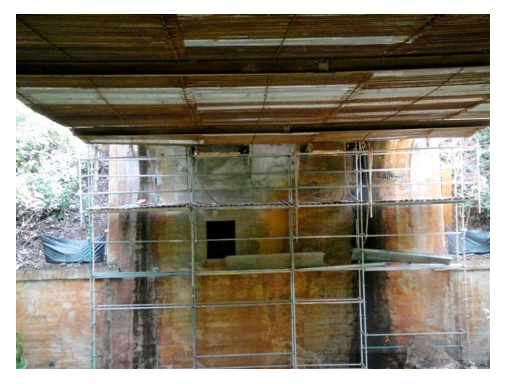
Cable Supported/Metal Deck Platform System W/Center Span Shoring Support Note Anchor Plate End Connections Beyond