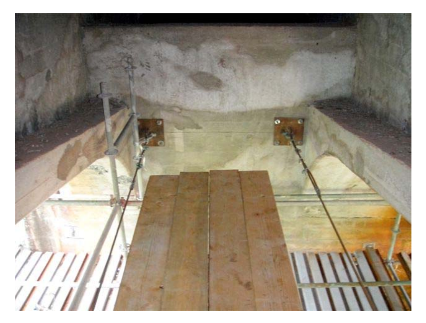
Anchor Plate End Connections For Transverse Support Cables